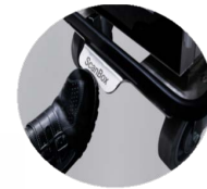
includes central brake